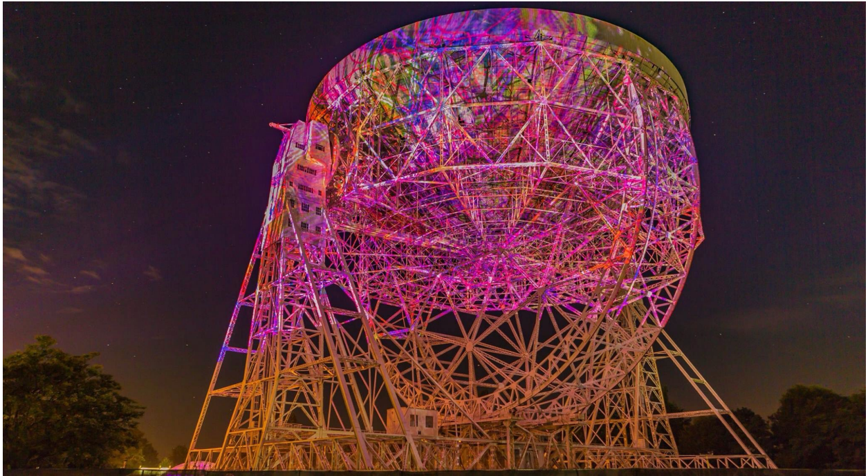
Jodrell Bank.

The newly crowned UNESCO World Heritage Site stages the fourth edition of Blue Dot Festival this summer.