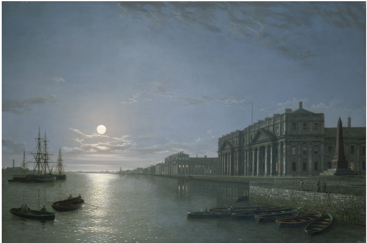
The Thames and Greenwich Hospital by Moonlight by Henry Pether. Credit: National Maritime Museum, London BHC3870

The largest exhibition in the UK dedicated to the moon opens on 19 July at the National Maritime Museum.