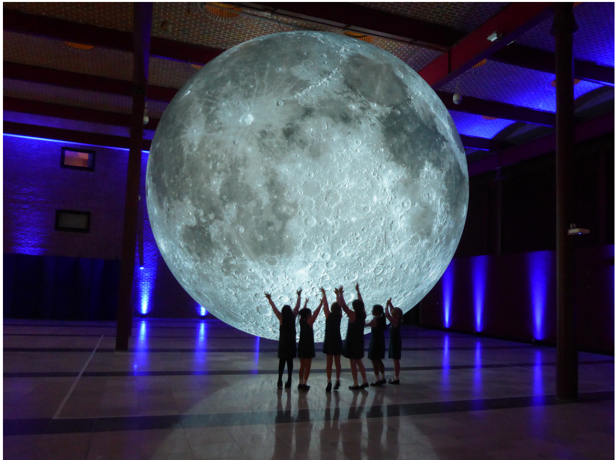
Museum of the Moon.

Armagh Observatory and Planetarium is taking One Giant Leap to mark man's pioneering trip to the moon.