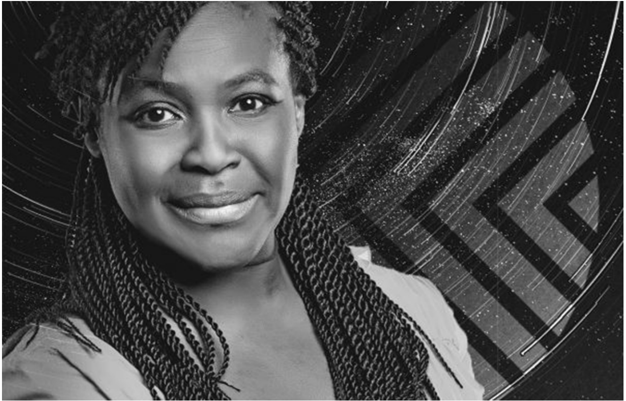
Dr Maggie Aderin-Pocock is set to talk.

Across the Royal Borough of Greenwich, a whole week of cosmic festivities will commemorate the moon landing anniversary .