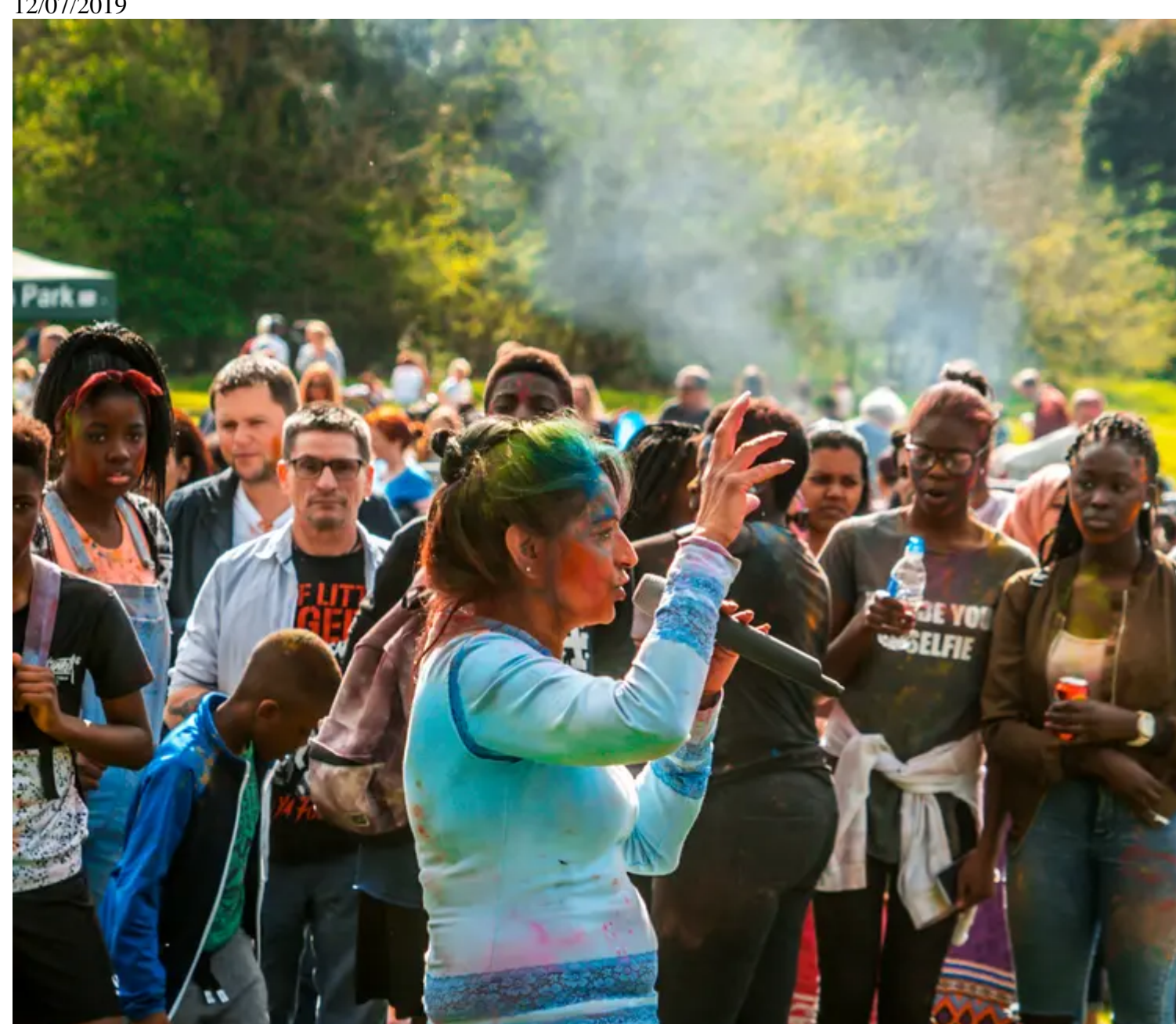
In 2019, we celebrate 25 years of supporting heritage good causes around the country.

In that time, The National Lottery Heritage Fund has invested £1.6billion of National Lottery money in landscapes and nature.