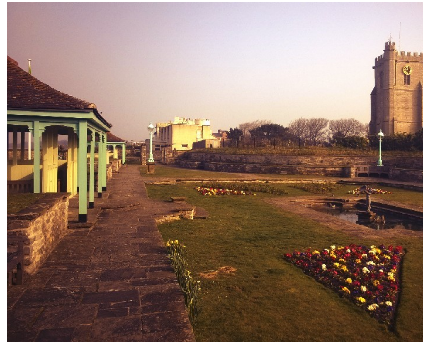
Marine Cove Gardens in Burnham-On-Sea

Marine Cove Gardens in Burnham-On-Sea in Somerset is possibly one of the smallest green spaces we've ever funded. The tiny but perfectly formed 0.17 hectare of formal gardens was originally part of an old vicarage site. Almost a decade on from our award, it is still going strong, and the much-loved lion head fountain remains in use.