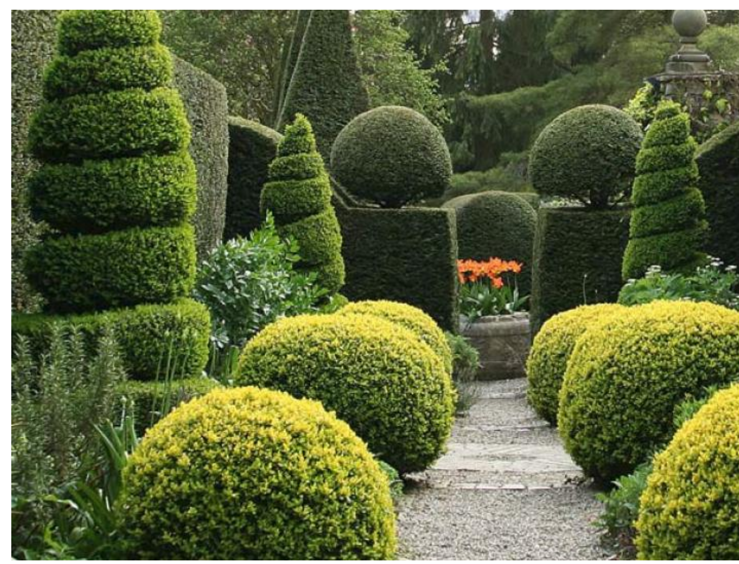
York Gate Gardens

Our funding also helped to shine a light on the miniature masterpiece of design that is York Gate Gardens . Tucked away in the village of Adel on the outskirts of Leeds, it's a magnificent example of the Arts and Crafts movement in garden form. In 2017 it was named by The Times as "the seventh best garden to visit in the UK".