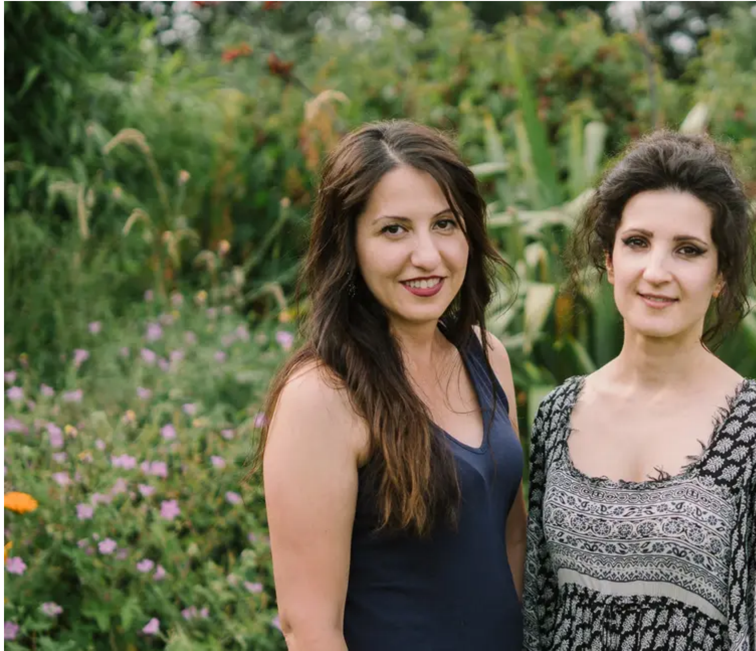
Getting involved in heritage can be a great way to make friends. Those who have, tell us what a difference it has made to their lives.