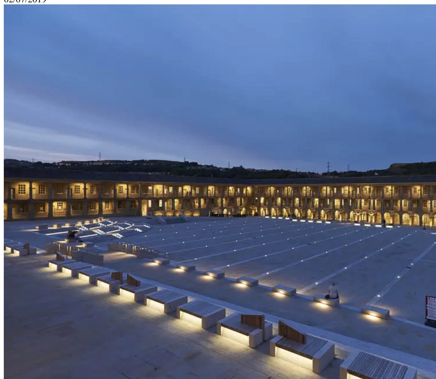
In part two of our closer look at The Piece Hall Transformation project, we look at the successes and challenges along the way.

• Read: Part one: what saving Piece Hall did for Halifax.