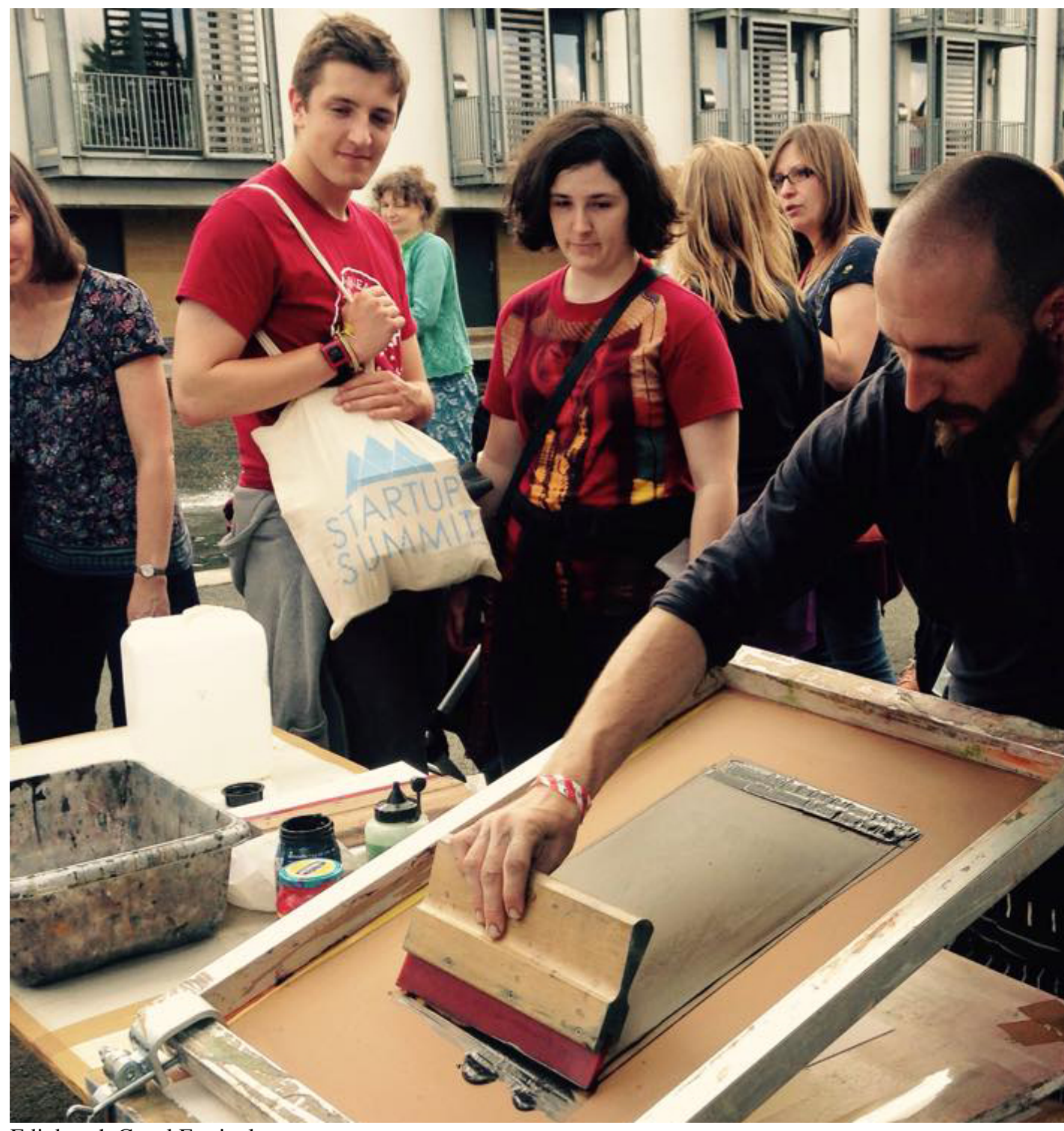
Edinburgh Canal Festival

And did you know that the site was formerly the headquarters of the North British Rubber Company, now wellie-makers Hunter?