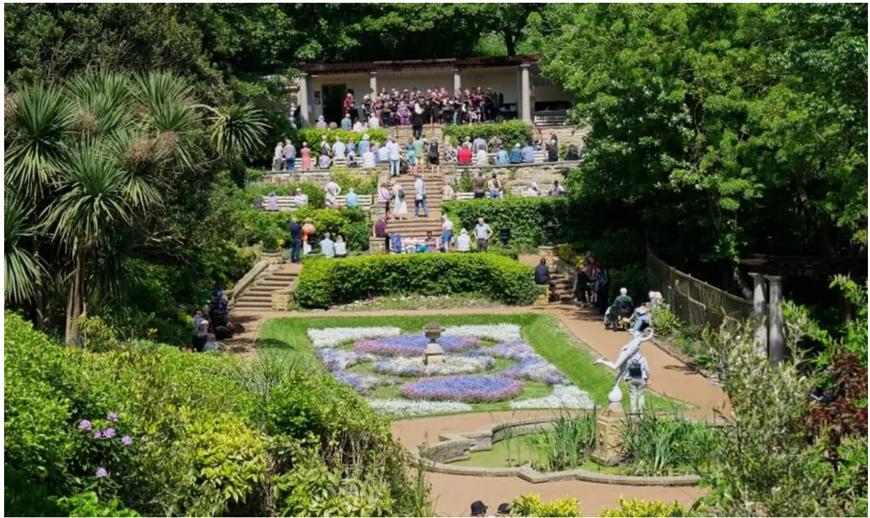
South Cliff Gardens.