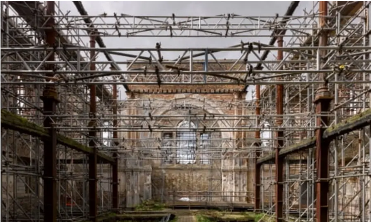
Sheerness Dockyard: before.