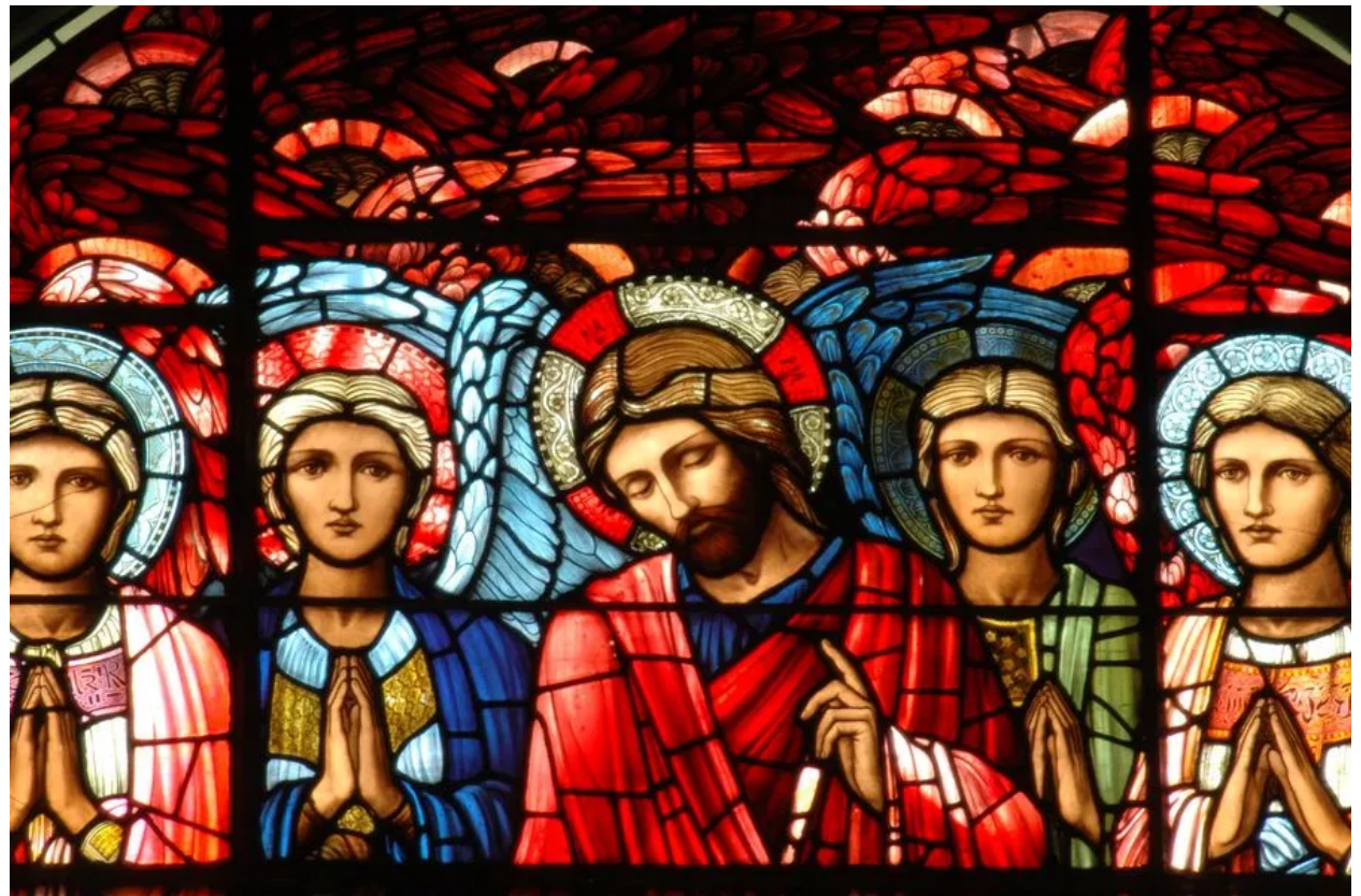
Burne-Jones Stained Glass Window at Birmingham Cathedral.