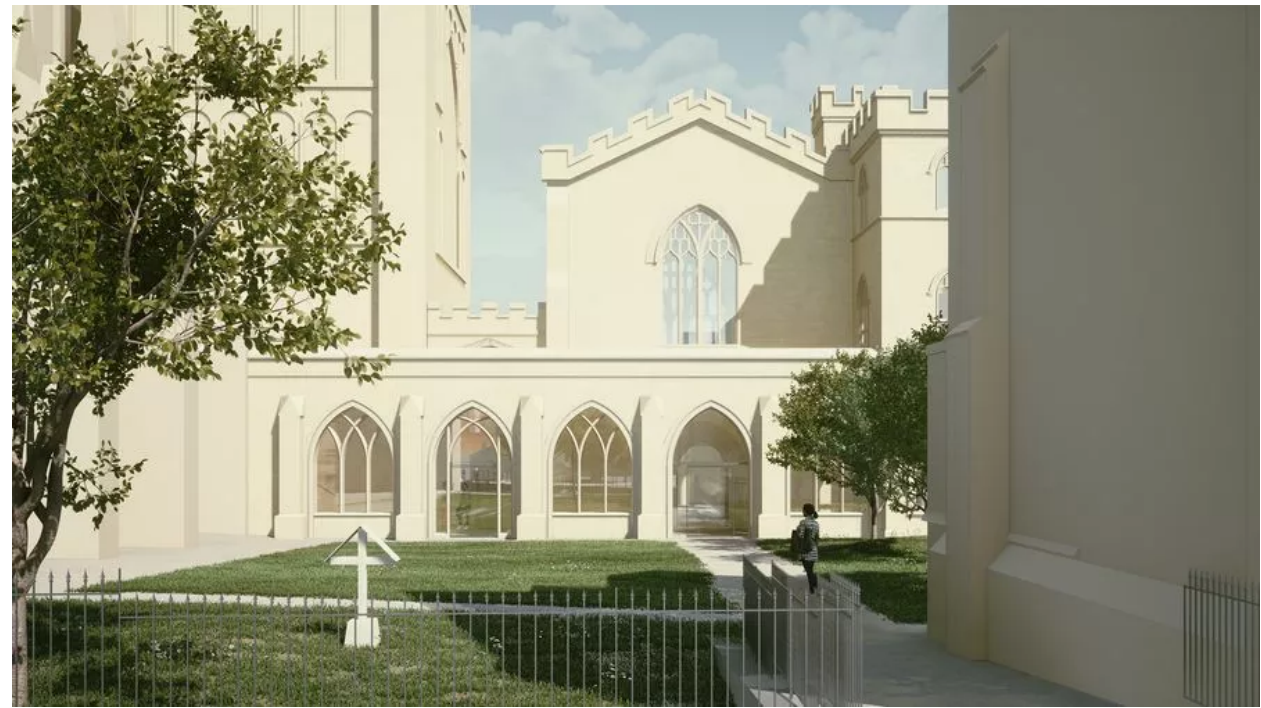
Exeter Cathedral New Cloister Gallery - West Elevation. Credit: Acanthus Clews Architects / Marvin Chic