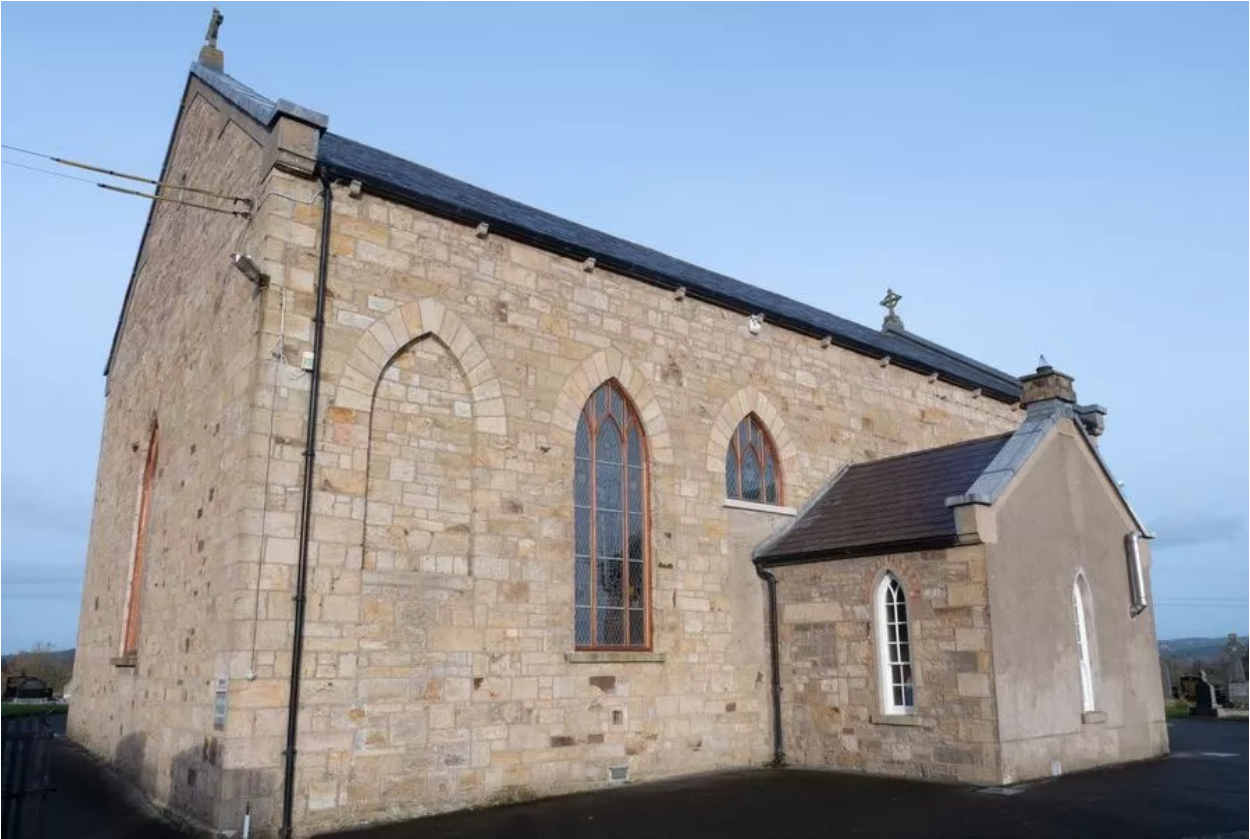
Outside of St Macartan's, The Forth Chapel, Augher.