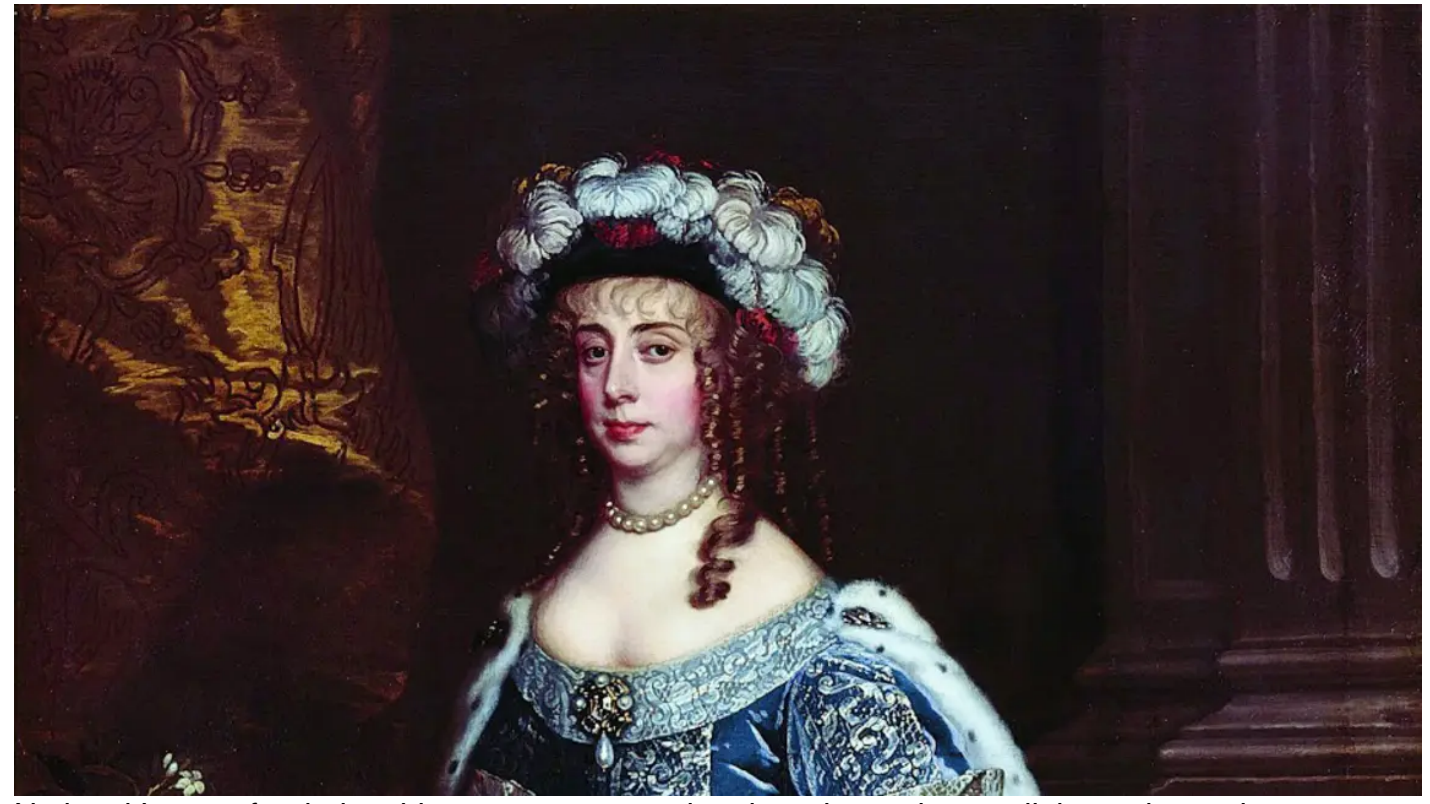
National Lottery-funded archives, museums and projects have shone a light on these six remarkable women.